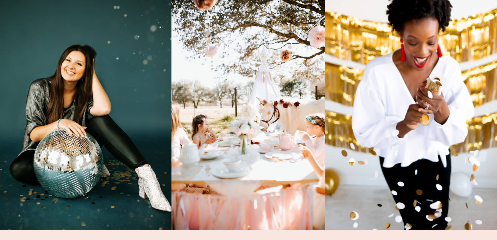
BRANDING, BUSINESS, & HEADSHOTS

Branding sessions are $485 for a gallery of 20 digital images. There is also an option to upgrade & purchase more images after seeing the gallery.