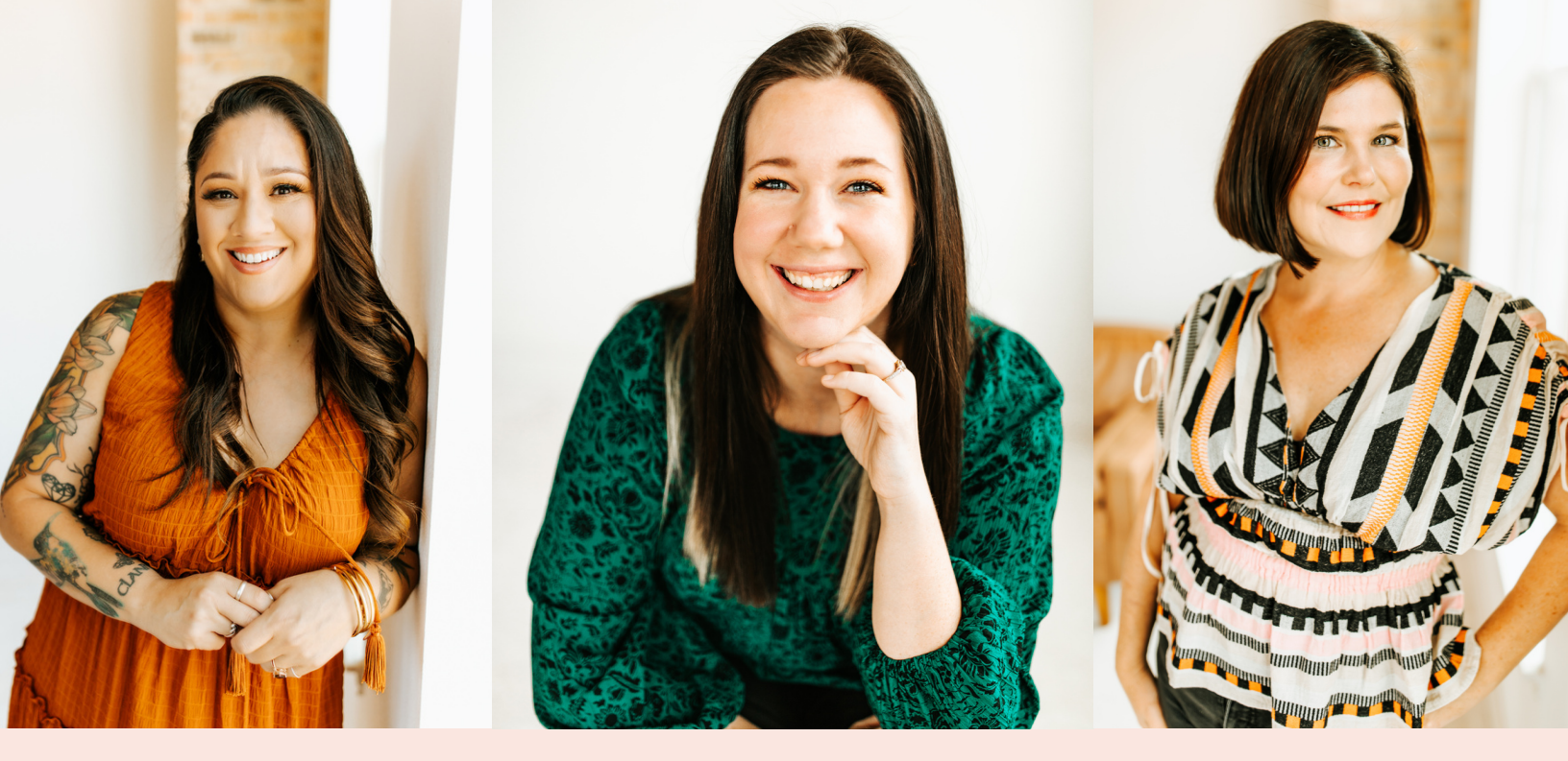
BRANDING, BUSINESS, & HEADSHOTS