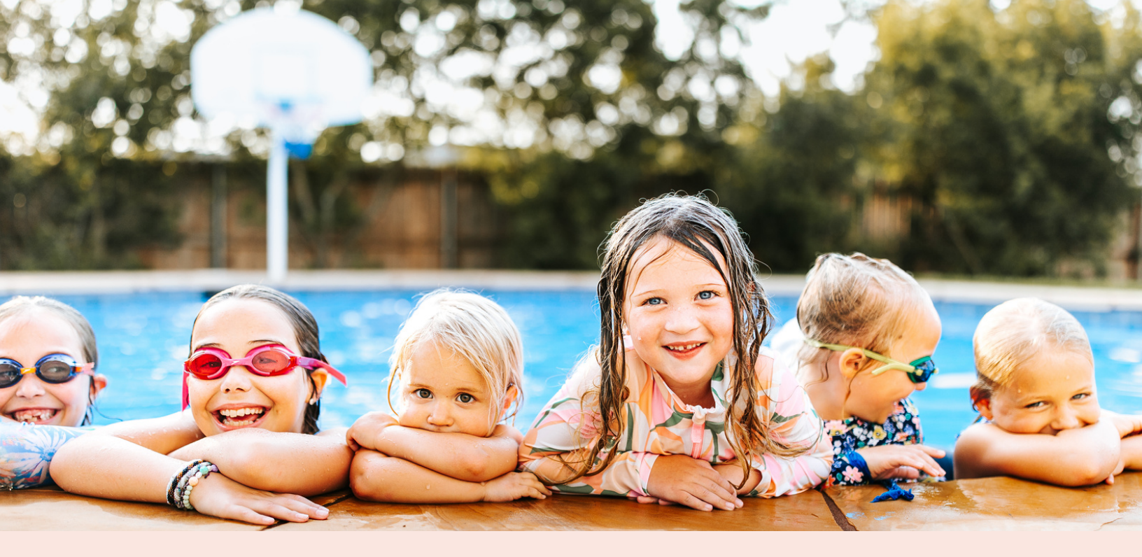
BRANDING, BUSINESS, & HEADSHOTS